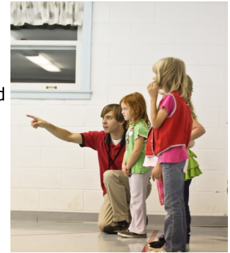
Sparkies enjoy Game Time

signed for his or her grade level. Once a child completes the entrance booklet, he or she is an official