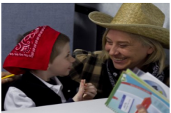
A Sparkie with one of our leaders

At Northside Calvary's Awana club, we love kids! We consider it a privilege to work with the children who come each week, and we desire to share with them the God who loves them unconditionally and sent His Son Jesus to die for their sins.