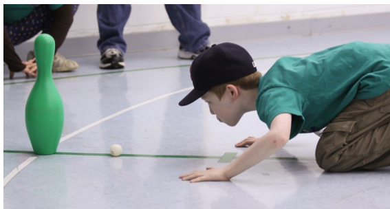
A T&T clubber participates in Game Time.

signed for his or her grade level. Once a child completes the entrance booklet, he or she is an official