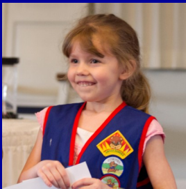
A Cubbie on Awards Night

This sentiment is often heard from parents throughout the Awana year. Kids love Awana! From the games to the verses learned to the lessons shared from God's Word, the time spent at Awana is enjoyed by children, and the truths learned there will impact them for a lifetime. We look forward to seeing your child at Northside Calvary's Awana program on Wednesday evenings from 6:20 p.m. to 8:15 p.m., September through April.